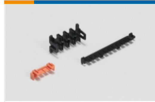
Rectangular Connector Locking(14)